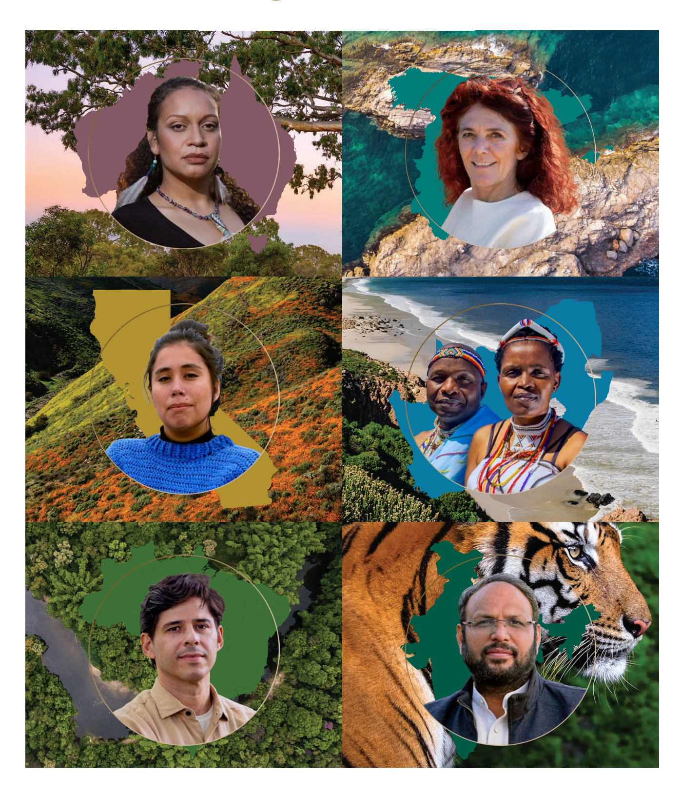
2024 ANNOUNCEMENT TOOLKIT